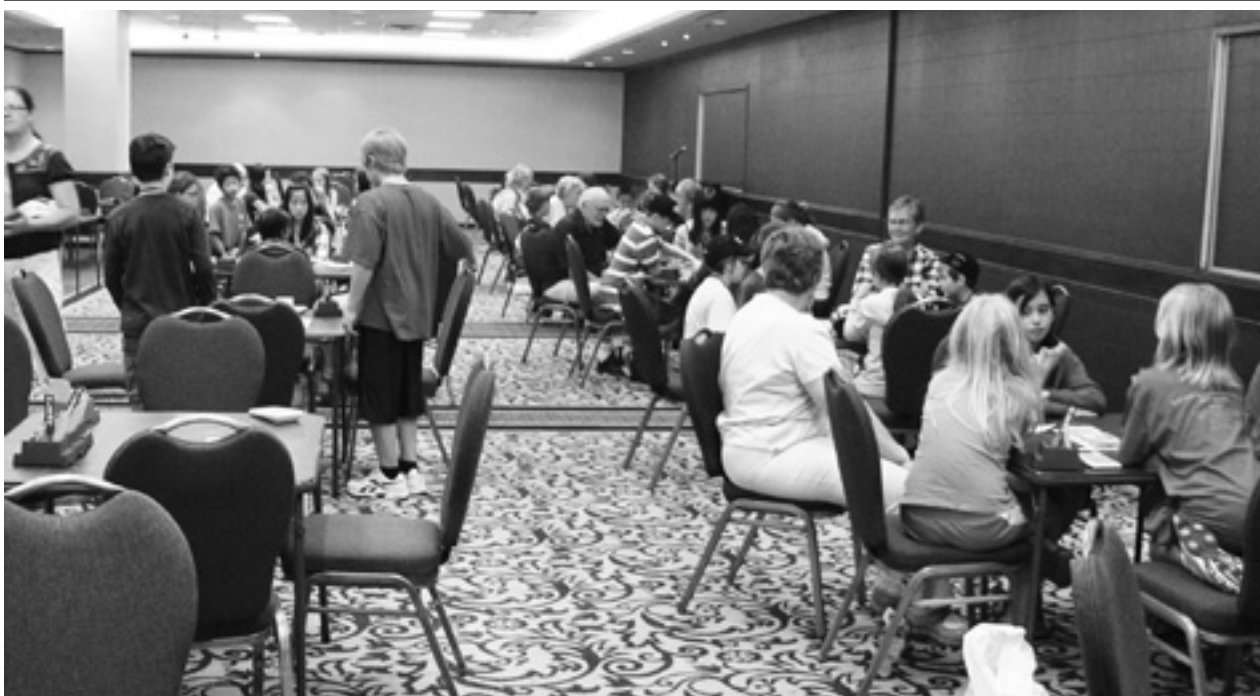
While the Youth Open Pairs was in progress, younger players were competing in the Card Rook Pairs.